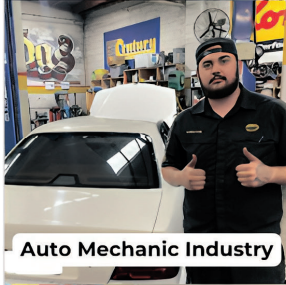
Auto Mechanic Industry