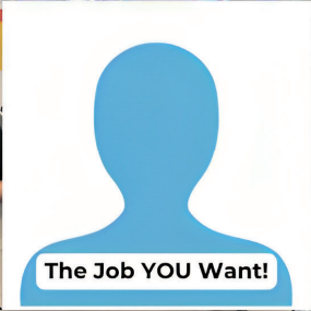
The Job YOU Want!