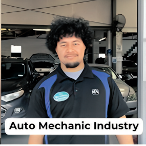
Auto Mechanic Industry