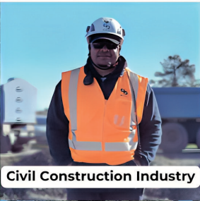
Civil Construction Industry