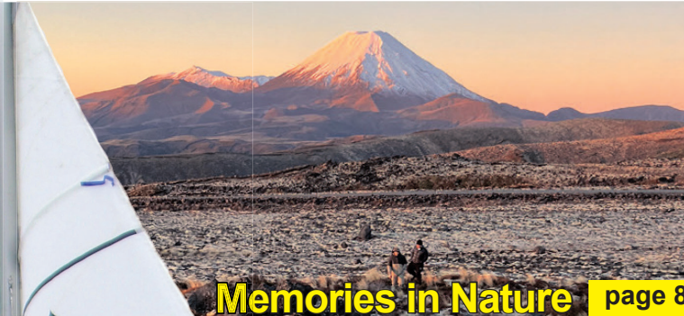
Memories in Nature page 8