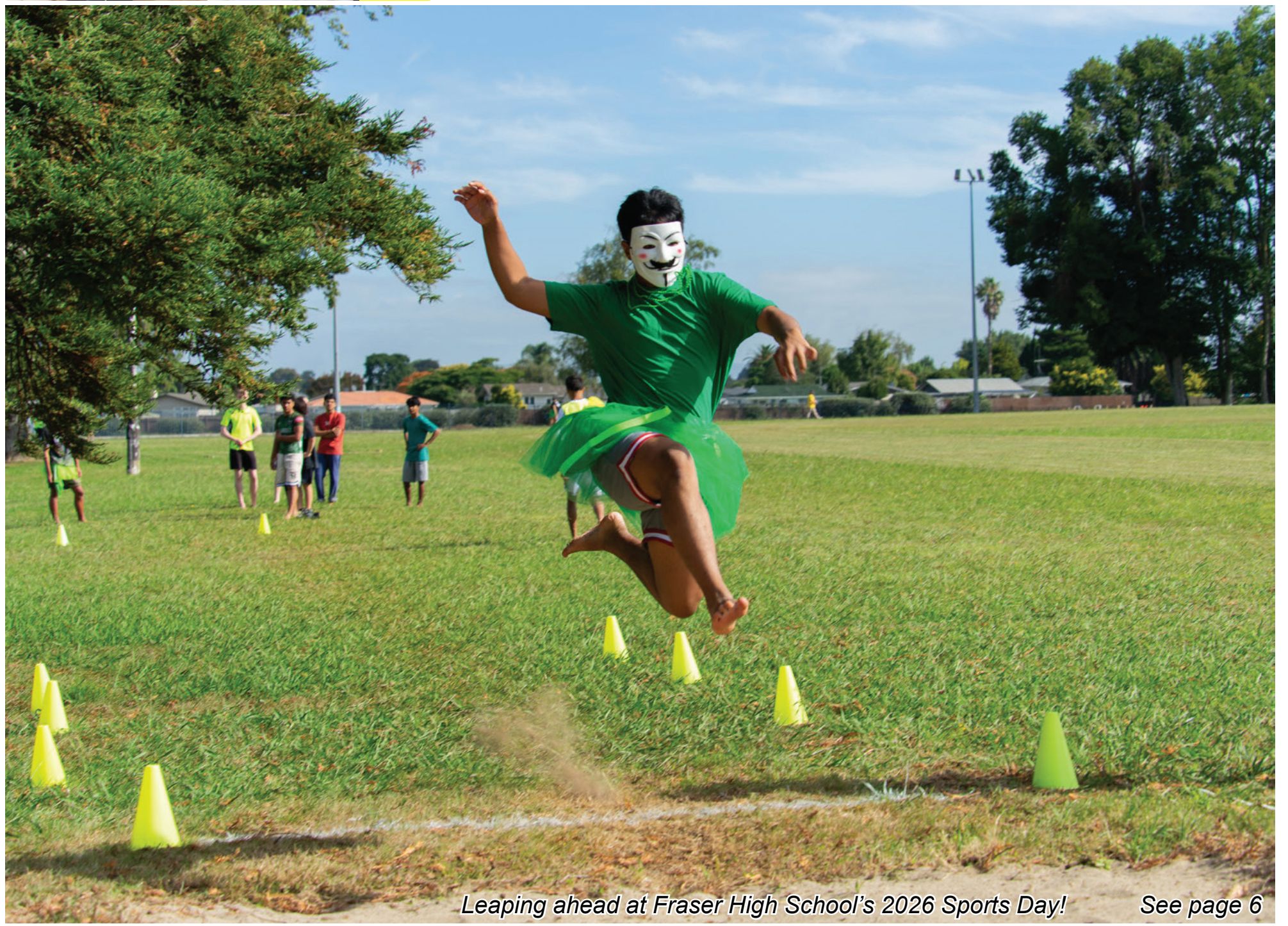
Leaping ahead at Fraser High School's 2026 Sports Day!